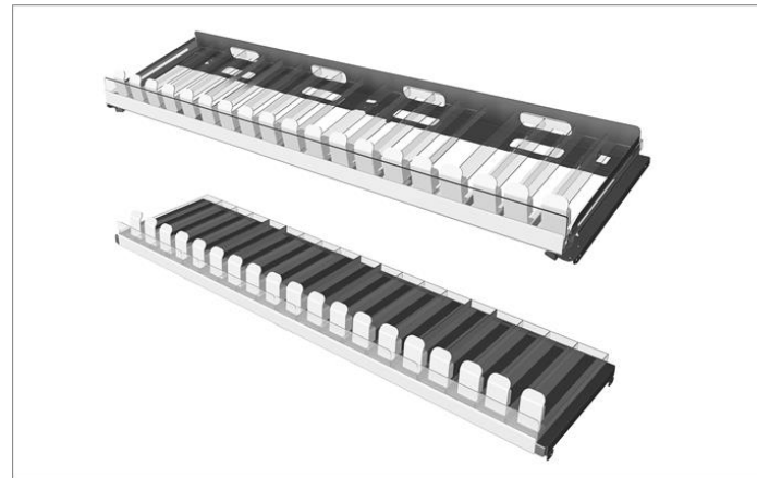
Product trays with spring merchandising.